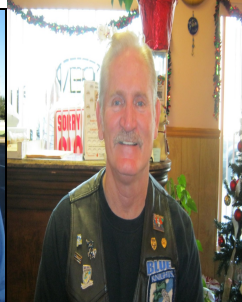
Chapter Vice President