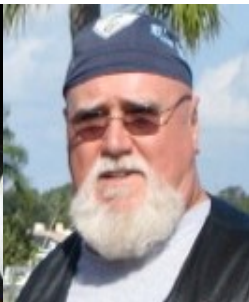
Chapter Vice President And Chief Photographer